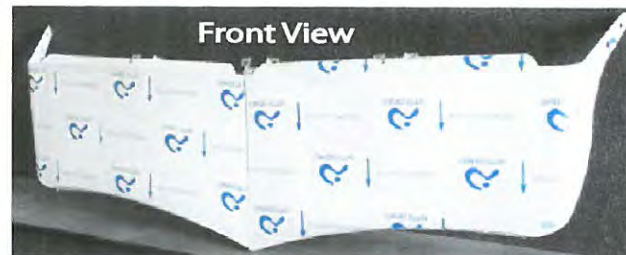
VISOR 1/2s Bolt Together