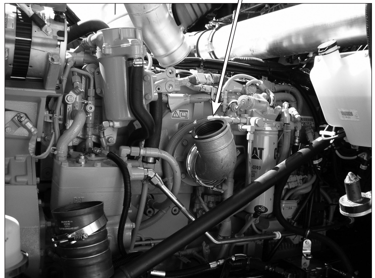
AIRCELL SPACER LOCATION